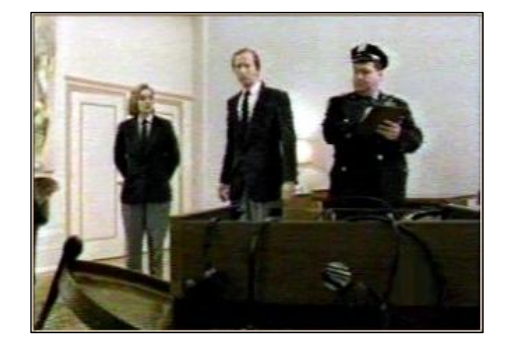
3.3 "The Case of the Parking Meter Massacre"