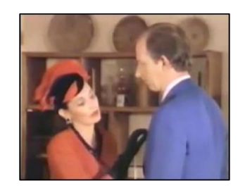
1.6 "The Mystery of the Maltese Pigeon"

gravel pits and with chemical traces of the stolen dirt. Now that Fish is dead, his accomplice may be attempting to nab the money.