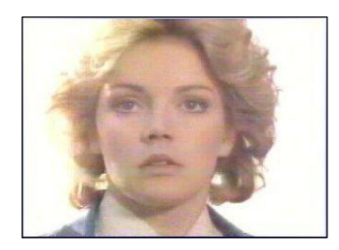
2.2 "The Case of the Great Car Robbery"

bird shops and taxidermists, he is found in Norman Tedge's apartment. Meanwhile, George and Walter figure out the pattern by using modular arithmetic on Fibonacci's sequence, and they all leave to see what's behind the single incorrect tile on the wall.