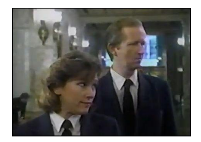
4.6 "The Case of the Purloined Policies"

Pat and George are asked to help the 19th Precinct through a burglary crisis. Young, overbearing, greedy, upwardly mobile rude twerps (YOGURTs) are being robbed of unusual appliances while staying at the Poconos Paradise resort in Pennsylvania. The Mathnetters suspect J. Thurlow Muck, the owner of Poconos Paradise, until another precinct has a similar rash of burglaries of middle aged rich people (MARPs) in Atlantic City. Meanwhile, George sets up a new computer with useful database software. They find a link between the sets of burglaries in a Bayonne, New Jersey mailing house owned by I. O. Privacy, who is arrested. She escapes to Mathnet HQ where she uses her knowledge to help predict where the next burglaries will happen. They stake out an apartment and catch a burglar, as does two other police teams. Privacy claims that someone hacked into her system via computer, and the log shows J. Thurlow Muck's phone number. However, she slips that she knows a bit too much about the investigation.